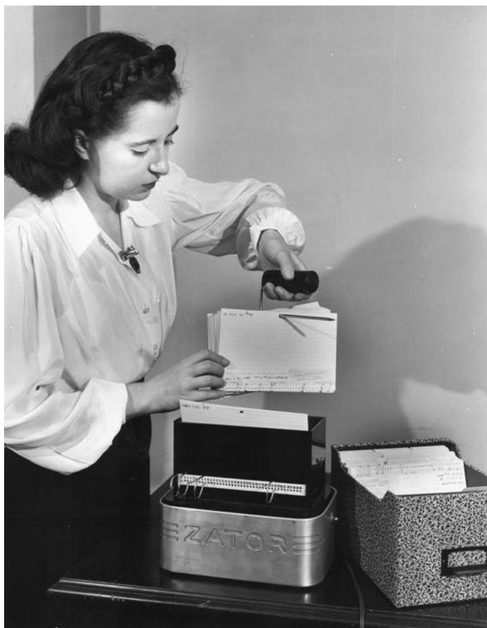
Figure 3. Punched cards with digital information came in many forms. Here in 1948 a demonstration of Calvin Mooers's Zatorcoding system for coding, classifying, storing, and retrieving information. Mooers is credited with coining the term information retrieval in 1950; his papers are at CBI.

software development that were possible at some time, these authors ask how institutional dynamics influenced the actual developments in favor of one potential outcome or another. If the older studies were strong on description, these studies move more assertively to an analysis of how and why certain paths were chosen as well as how and why certain results came to be—while others did not. 23