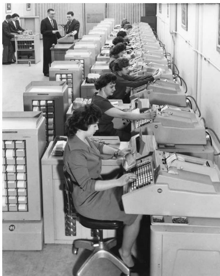
Figure 2. The "information age" coupled computing technologies to the routinized processing of information. Here, in 1960, nine operators enter bank transactions into Burroughs F-600 machines, probably at a St. Louis, Missouri, bank.

In different ways, these studies each place the story of the technical developments in