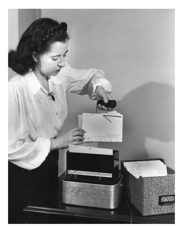
Figure 3. Punched cards with digital information came in many forms. Here in 1948 a demonstration of Calvin Mooers's Zatocoding system for coding, classifying, storing, and retrieving information. Mooers is credited with coining the term information retrieval in 1950; his papers are at CBI.

software development that were possible at some time, these authors ask how institutional dynamics influenced the actual developments in favor of one potential outcome or another. If the older studies were strong on description, these studies move more assertively to an analysis of how and why certain paths were chosen as well as how and why certain results came to be—while others did not.<sup>23</sup>