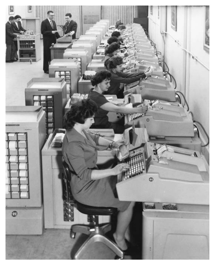
Figure 2. The "information age" coupled computing technologies to the routinized processing of information. Here, in 1960, nine operators enter bank transactions into Burroughs F-600 machines, probably at a St. Louis, Missouri, bank.

In different ways, these studies each place the story of the technical developments in